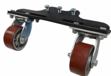
TRANSPORT DOLLY PG-10544